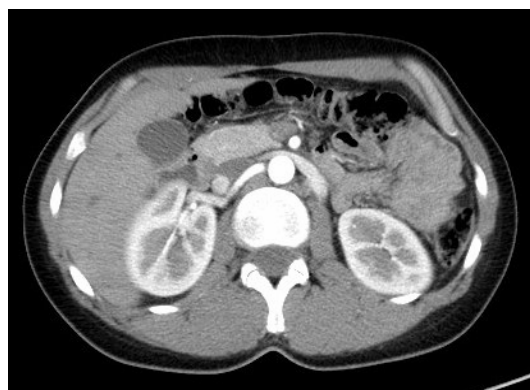
Fig. 2 – Compression of the left renal vein between the aorta and the superior mesenteric artery, multidetector computed tomography (MDCT) transverse section